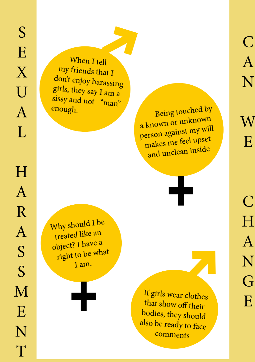
THE VOICES ON